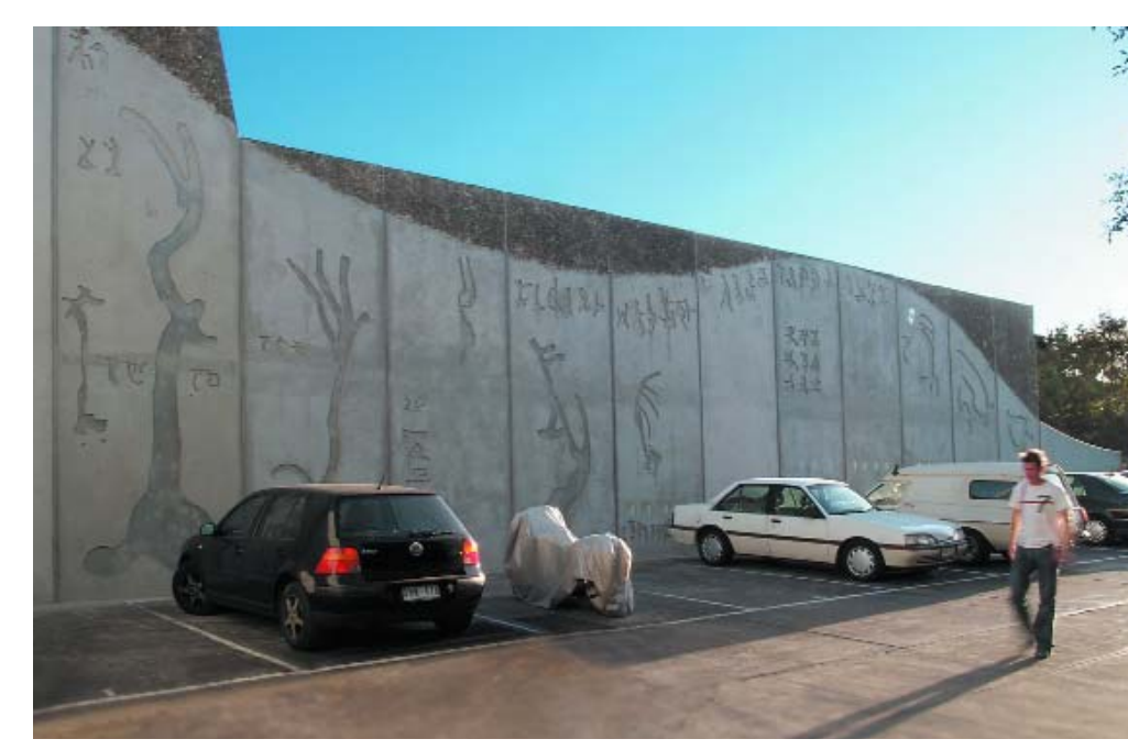
The Wall responds to and intermingles with the brusque edginess of the local landscape. Michael Downes - Urban Angles Photography

The Substation Wall invigorates what was previously an incidental and purely utilitarian space into a new realm of shared space.