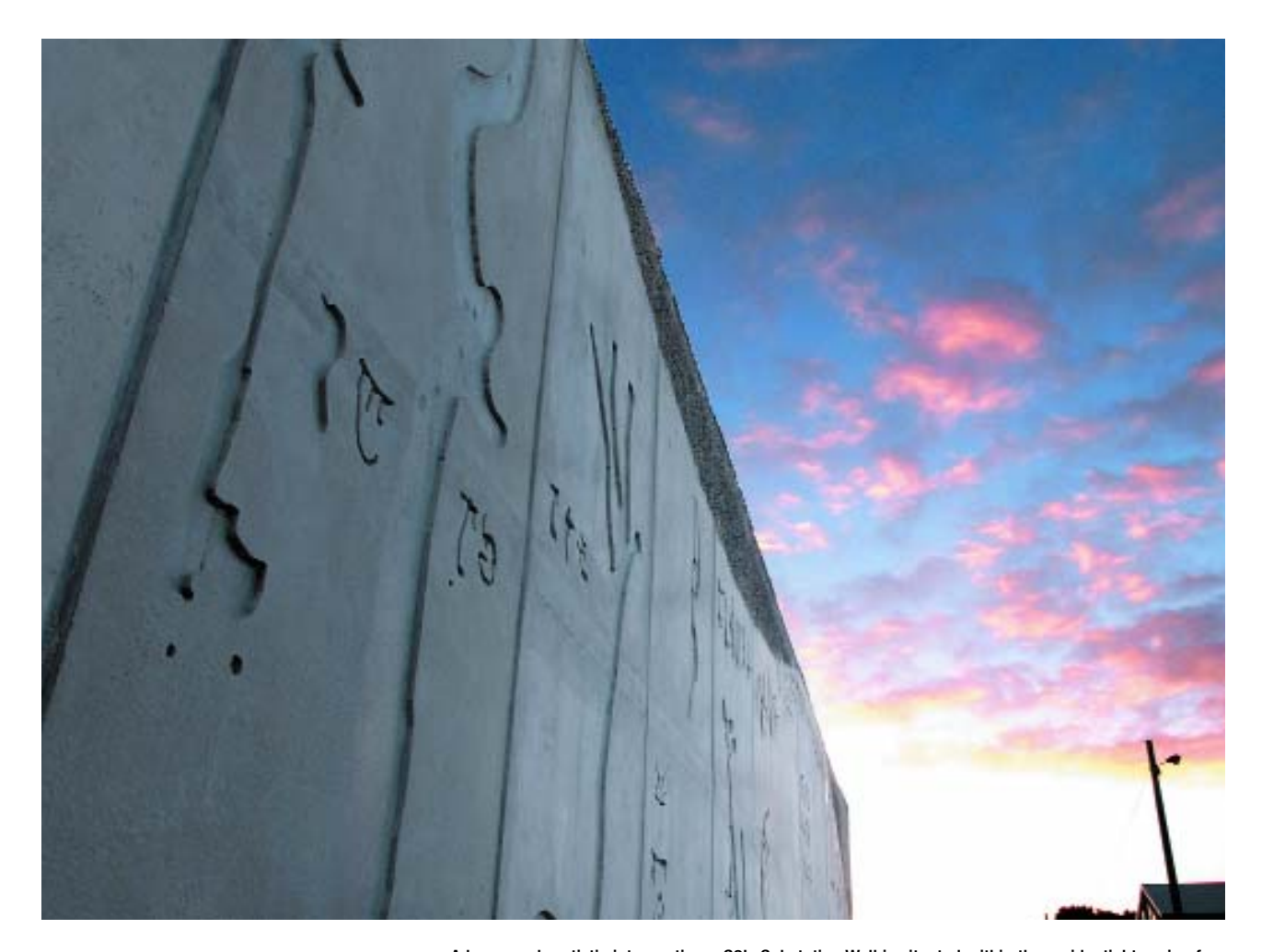
A large-scale artistic intervention – S2's Substation Wall is situated within the residential terrain of Balaclava, Victoria.